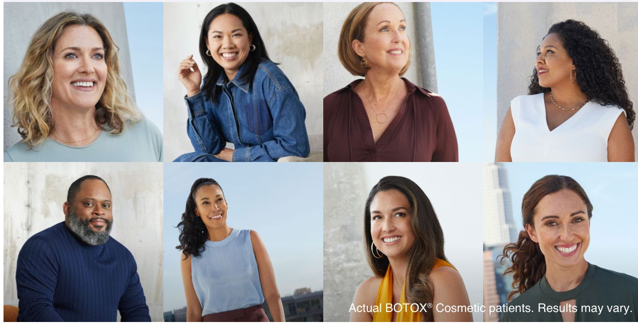
Actual BOTOX ® Cosmetic patients. Results may vary.

Patients are often treated with BOTOX ® Cosmetic three times a year, with appointments spaced at least 90 days apart. Discuss with us what may be right for you.